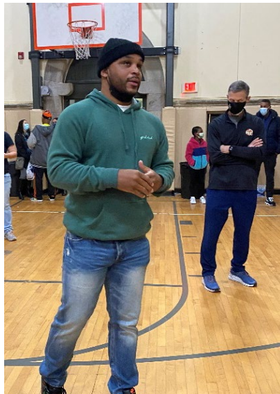
Former NBA star Jameer Nelson signing autographs

The Department of Behavioral Health and Intellectual disAbility Services (DBHIDS) Housing and Homeless Unit is excited to highlight Hoops 4 Hope (H4H), a nonprofit organization that utilizes basketball to engage and empower individuals experiencing homelessness in Philadelphia.